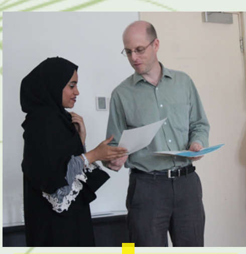
b. Winner of Certificate -Health and Safety -First Aid and Fire fighting

a. Certificate -Health and Safety -First Aid and Fire fighting