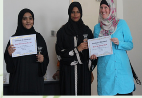
Winners of Kahoot- a game using mobile phones